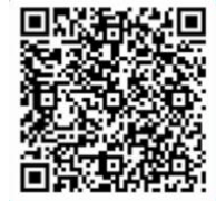
Meeting Minutes Form

Committees must meet monthly and complete the Committee Meeting Minutes Form. Representatives are encouraged to also use this form to submit findings.